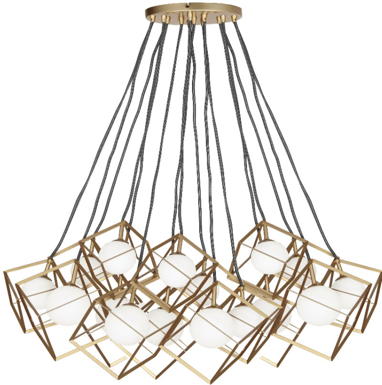
16 Light Halogen Pendant, Gold with White Glass

Height 13.75 Width/Length 35 Depth 35 Weight 22