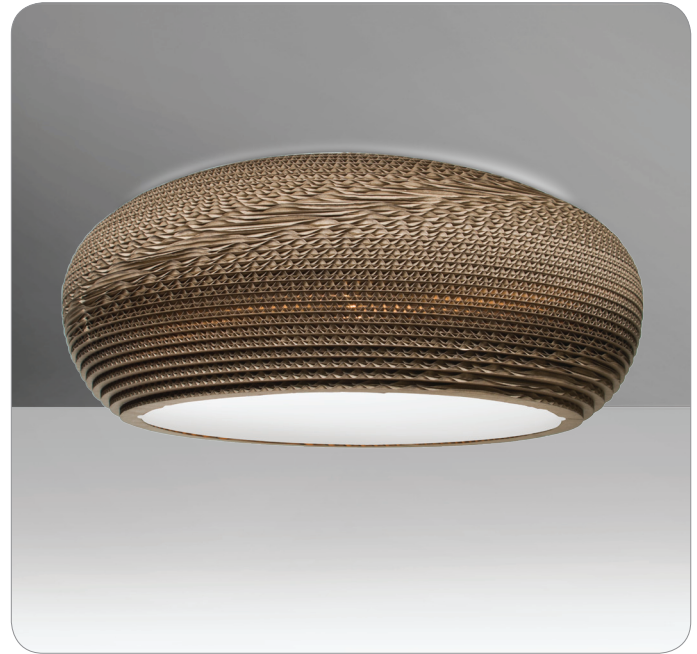
V E N U S

UL or ETL Listed. Suitable for Dry Locations (interior use only).